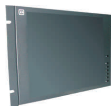
AC170R: 19" mounting kit