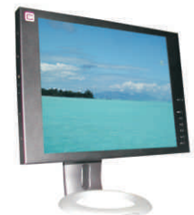
Accesorio para rack 19" ref. AC170R