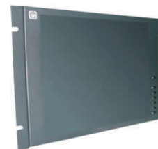
CM170-4PS con accesorio para rack 19" ref. AC170R