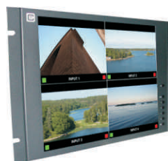
AC170R: 19" mounting kit