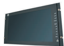
AC170WR: 19" mounting kit

Specifications are subject to change without prior notifications