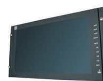
AC170WR: 19" mounting kit

Specifications are subject to change without prior notifications