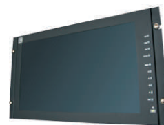
AC170WR: 19" mounting kit

Specifications are subject to change without prior notifications