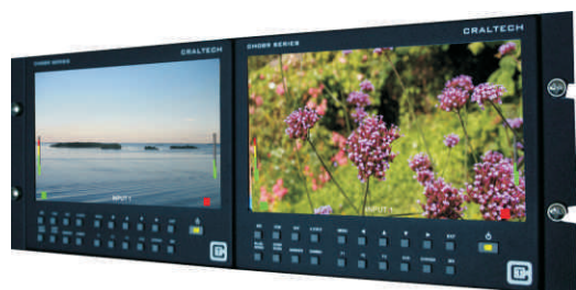
AC089R: 19" rack mounting kit