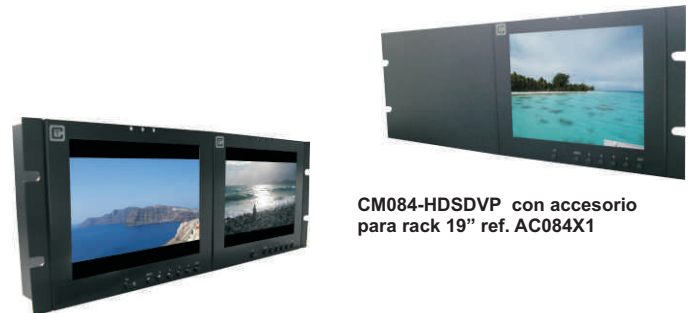
CM084-HSDVP con accesorio para rack 19" ref. AC084X1